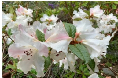
R. Fragrantissimum - highly fragrant, needs protection from frost in the winter