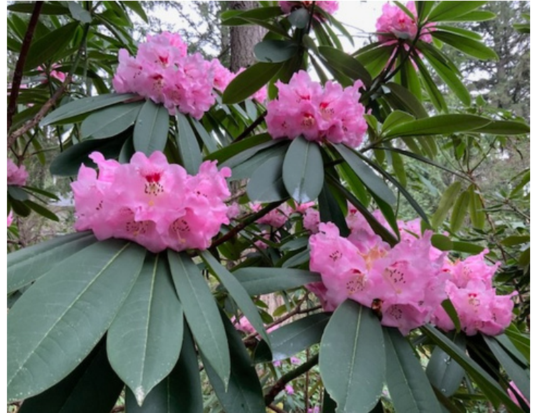
R. sutuense - big leaves