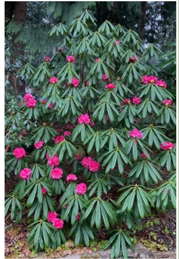
R. 'Len Living' - blooms in March